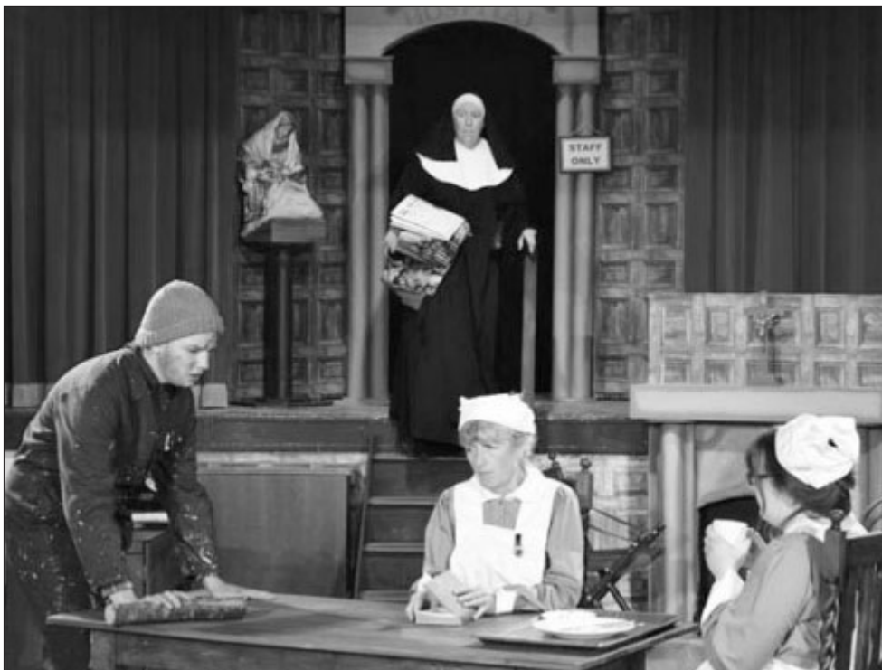
Photo below show a scene from the recent production of 'Bonaventure'

So, if you would be interested in joining the society – to show off your on-stage talent, or to be involved in an enjoyable, creative and rewarding drama-based activity – please contact the Society via its website www.radyr.org.uk/drama , by e-mail to rds@radyr.org.uk or contact Ian Ogden on 07711-713176. It is hoped at least some of you will decide to dip your toe in the amateur theatre water!