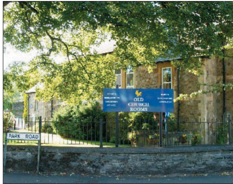
Old Church Rooms

The Weir Room has a new laminated floor, storage room and a screen. The Chain Room is a meeting room for up to a dozen people with a wall screen. The new room, still to be named is multi purpose and will have a screen, projection equipment and its own tea making area. All rooms will have access to WIFI. The upgraded kitchen is now in use to cater for up to 90 people and is of a commercial standard. All these rooms are available for hire by emailing - ocrbookings@radyr.org.uk