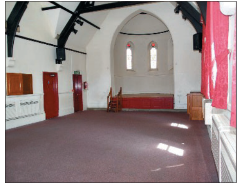
Garth Room 40ft x 22ft