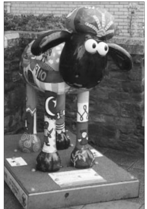
Seventy Shaun the Sheep appeared around Bristol during the summer of 2015.

Over the summer of 2015, Bristol celebrated Shaun the Sheep with over seventy sculptures of Shaun dotted around Bristol, which attracted huge crowds. We aren't expecting quite as many creations,