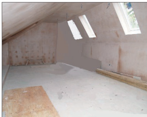
New Meeting Room 37ft x 14 ft