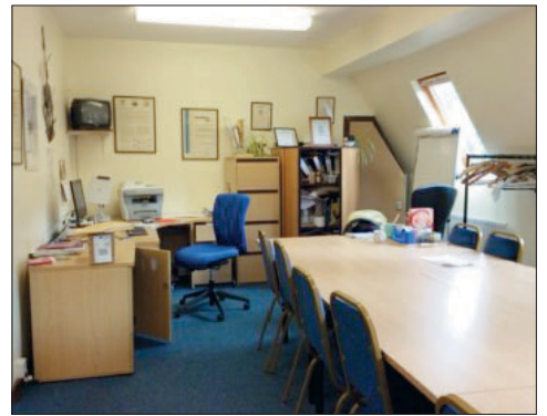
Chain Room 16ft x 14 ft