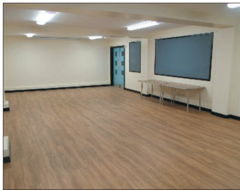
Weir Room 40ft x 17ft