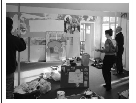
Artists developing our Foundation Phase Area