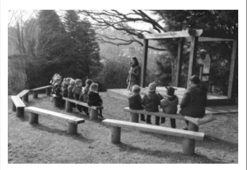
Our nursery children ready to go on a bear hunt around our nature trail