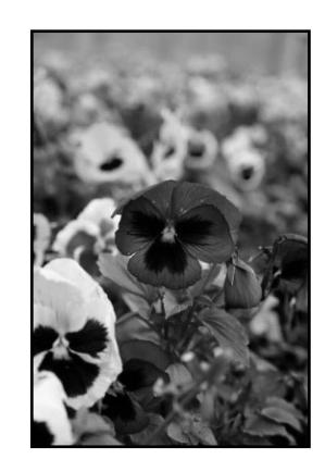
Pansies One of Britain's favourite flowers, the pretty pansy is easy to care for (enjoying any sort of most, rich soil) and will add a welcome splash of colour to any container

Tulips Available in a variety of striking shades, tulips are one of the easiest and most rewarding container garden