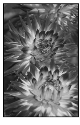
Dahlias Dashing dahlias grow extremely well in large pots or garden boxes and can cope with most soil and environmental conditions