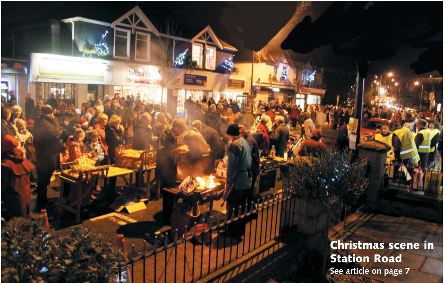
Christmas scene in Station Road