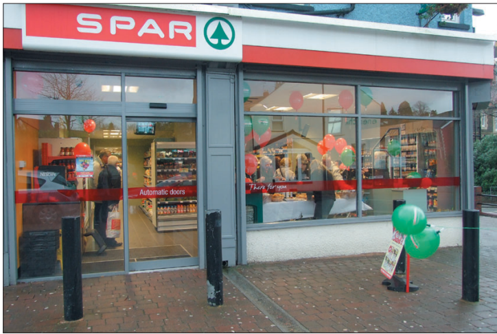
The new refurbished shop front