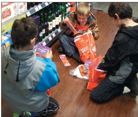
Children investigating their 'Goody Bags'