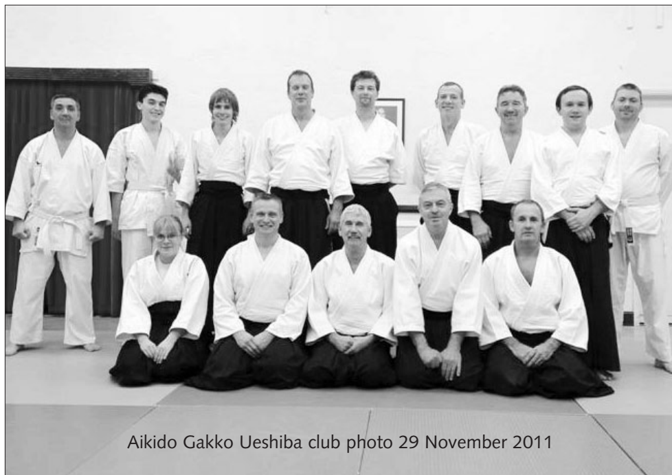
Aikido Gakko Ueshiba club photo 29 November 2011

A martial arts club based in Morganstown is marking its 30th birthday with a special course on 21st January. Aikido Gakko Ueshiba, which uses Morganstown Village Hall as its main training venue, practices a traditional form of the Japanese art aikido, which is a martial art derived from the principles of the historic samurai warriors.