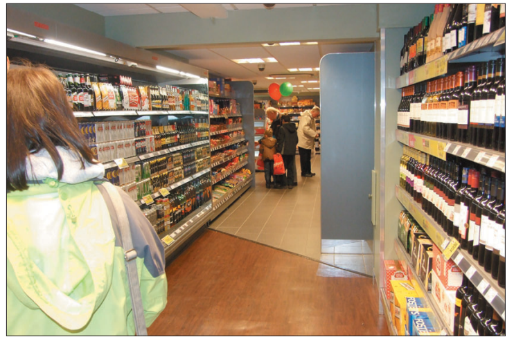
New wider aisles for customers' ease of movement