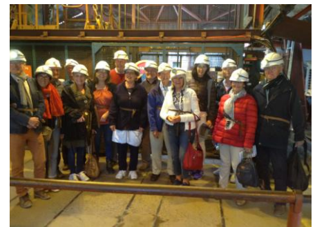
The Twinners at Big Pit